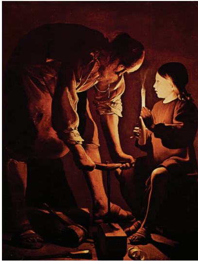
St. Joseph the Carpenter -Georges de La Tour 1642